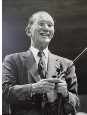
Dr. Shinichi Suzuki