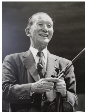
Dr. Shinichi Suzuki